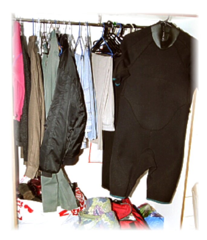
HAVE A CLEAR-OUT

By analysing your world, you will gain a better insight of yourself.