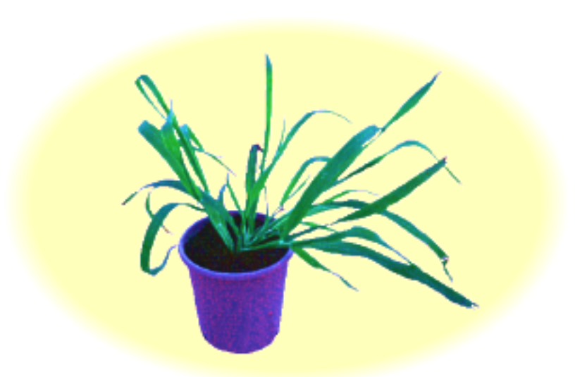
SOW A SEED

Whatever we affect and whomsoever we touch along the way, these things will justify our being.