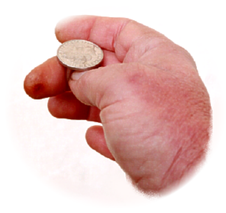
TOSS A COIN

If you don't have access to additional outside advice and the decision can't be deferred, trust your intuition and do your best to make it a wise choice.